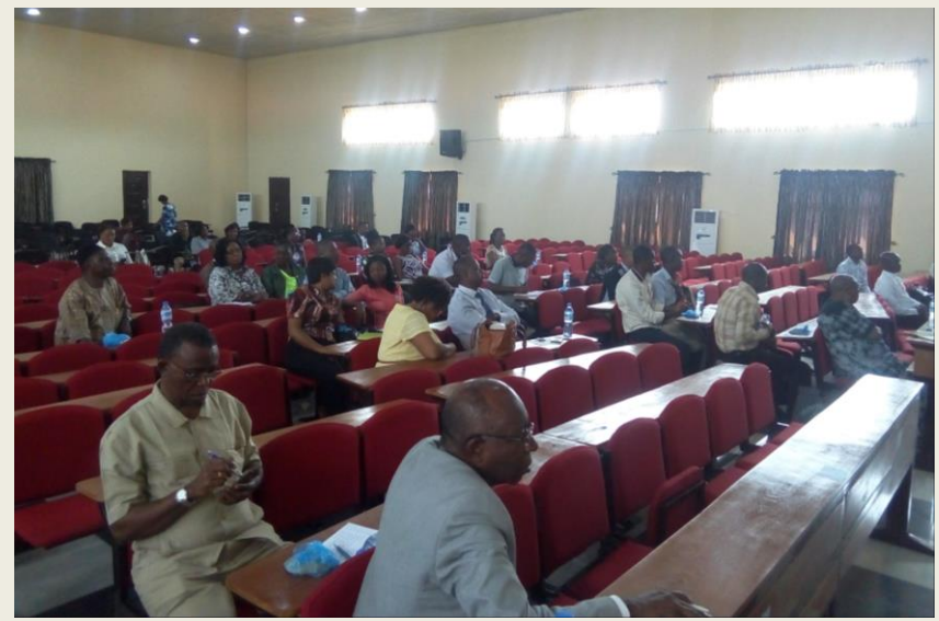
A cross-section of participants during the UNIMED 10th research seminar held at the Odosida main auditorium of the university